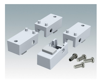
M5600015 Case Feet Kit 1 ABS (UL 94 HB) Light grey RAL 7035 34x17x16mm