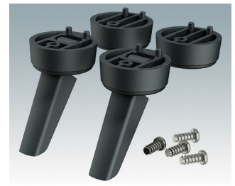
M6420204 Technofeet Kit 2 ABS (UL 94 HB) Anthracite RAL 7016 30x30x12mm