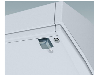
M5600100 Non-slip feet Rubber Transparent 12.6x12.6x5.7mm