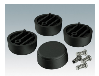
M6420109 Technofeet Kit 1 ABS (UL 94 HB) Black RAL 9005 30x30x12mm