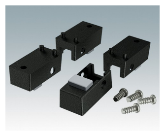
M5600019 Case Feet Kit 1 ABS (UL 94 HB) Black RAL 9005 34x17x16mm