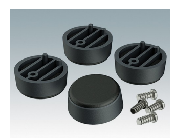
M6420104 Technofeet Kit 1 ABS (UL 94 HB) Anthracite RAL 7016 30x30x12mm