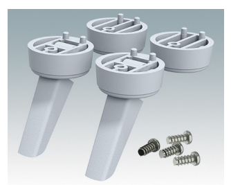
M6420205 Technofeet Kit 2 ABS (UL 94 HB) Light grey RAL 7035 30x30x12mm