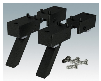
M5600049 Case Feet Kit 2 ABS (UL 94 HB) Black RAL 9005 34x17x16mm