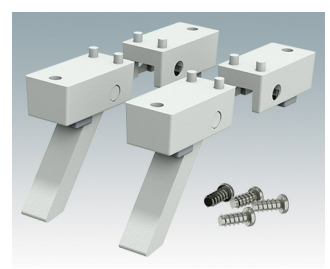
A9257207 Case Feet Kit 2 ABS (UL 94 HB) Off-white RAL 9002 34x17x16mm