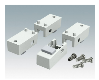
A9257107 Case Feet Kit 1 ABS (UL 94 HB) Off-white RAL 9002 34x17x16mm