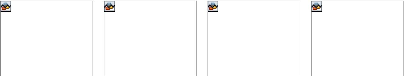
M4919115 VERSAMET 19" 1Ux165mm Aluminium Light grey RAL 7035 44x483x165mm