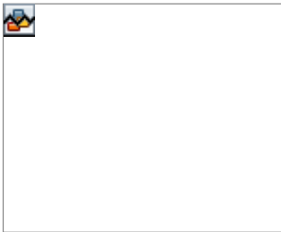
M5600010 PCB/Panel Fixing Screws, M3 Steel Zinc coated 6mm